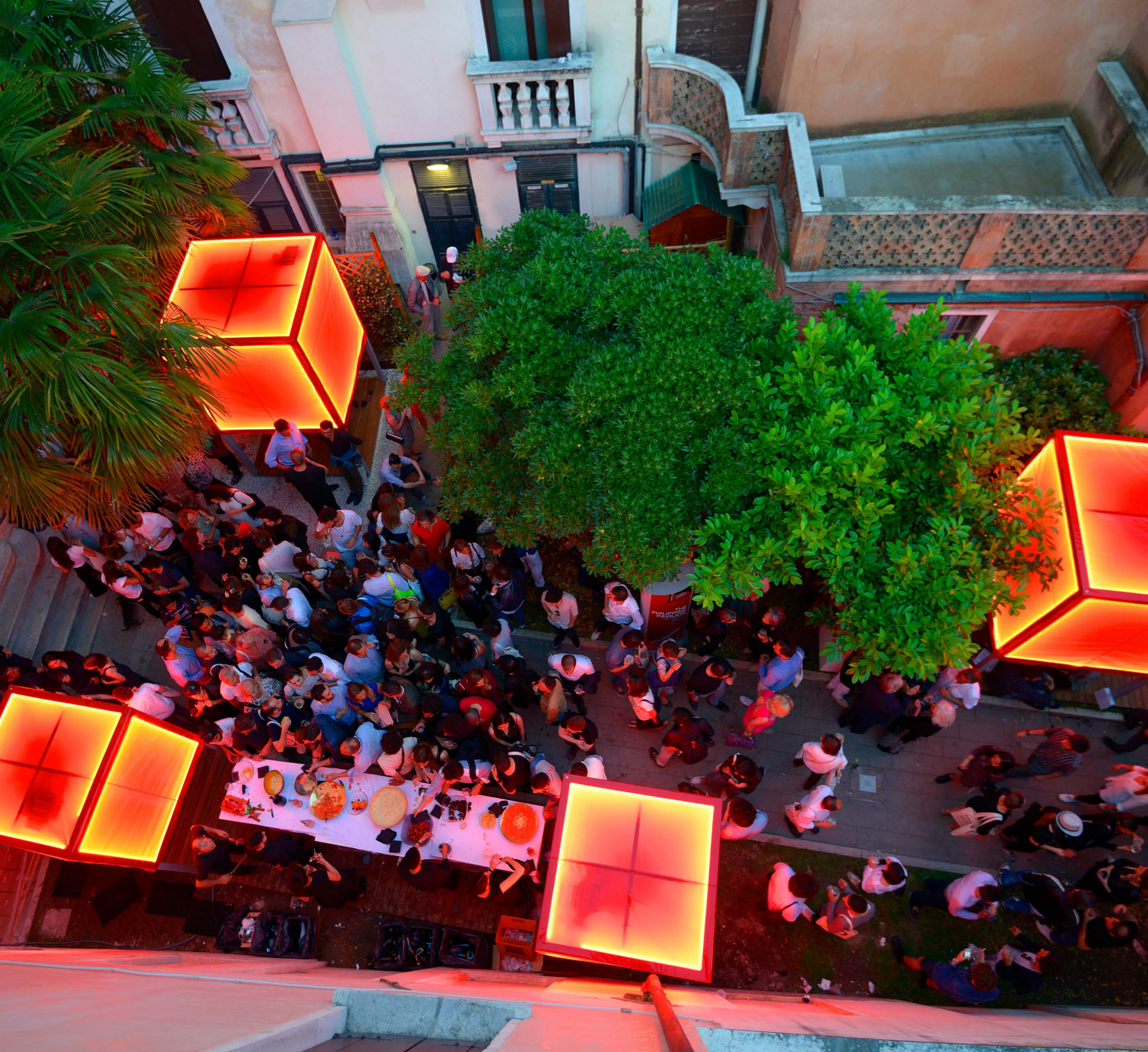
Opening event at the ECC in Venice

All your events can be made unique according to your wishes and are an effective tool to connect with clients, employees, business partners or friends and to be recognized on a larger scale.